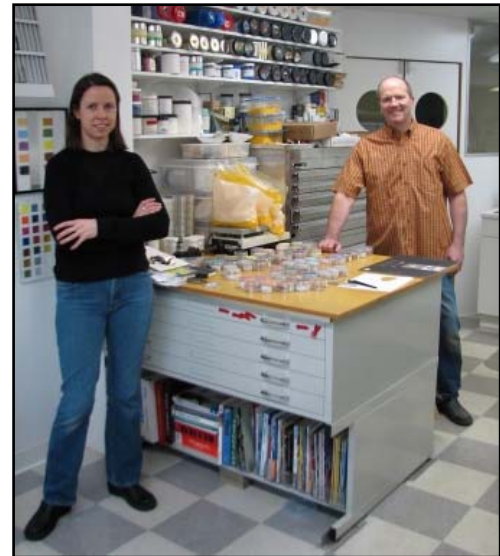
Where the magic happens, the testing studio